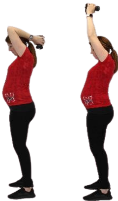
Triceps Overhead Extension

Stand with your feet hip-width apart and knees bent slightly. Hold a hand weight in each hand with your palms facing to the front. Keeping your core engaged and elbows next to your sides, lift the weights up toward your shoulders until you can bend your elbow no further. Slowly lower the weights back to your sides until your elbows are straight but not locked.